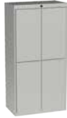
4-DOOR ADD ON