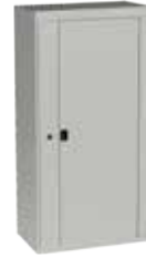
OVERSIZED ADD ON