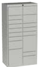
17-DOOR ADD ON