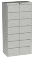
14-DOOR ADD ON