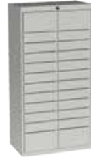
24-DOOR ADD ON