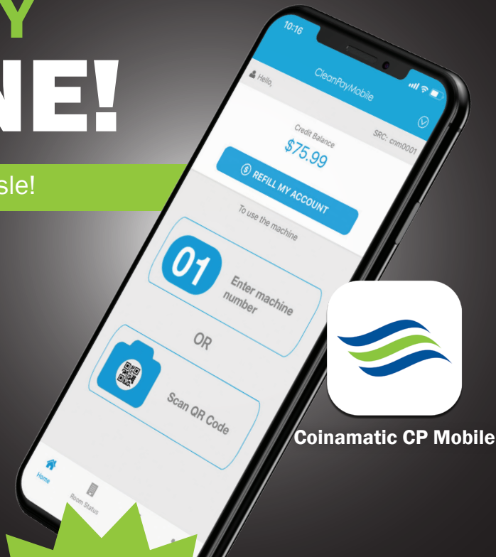
Coinamatic CP Mobile

Download the Coinamatic CP Mobile APP Today!